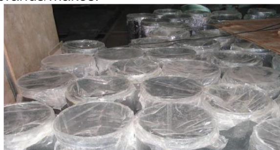
Ducts Wrapped With Plastic To Avoid Dust Ducts Stored with Properly Wrapped with Plastic