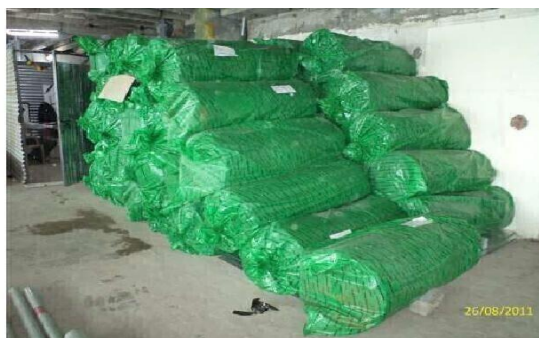
Equipment covered during Construction Phase